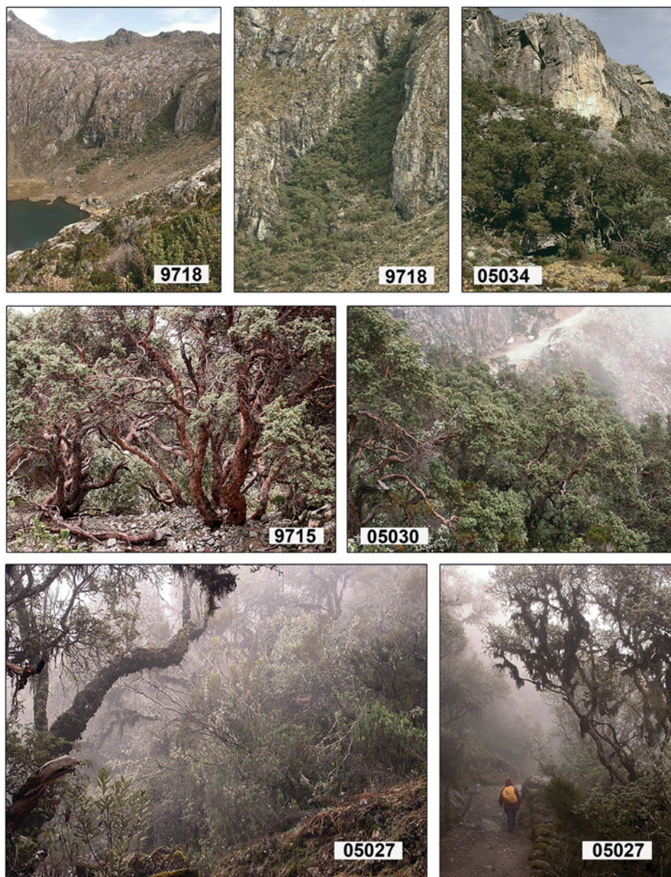
Fig. 3. Images of investigated Polylepis sericea stands.